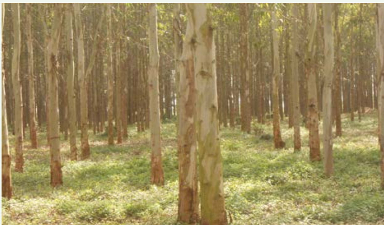
Figure 4: Biomass energy plantation- sustainable approach.

However, the adoption of these improved kilns has been low due to high initial investment costs, and costs of transporting the kiln from one area to the other for the Casamance kiln and cost of transporting the feed stock for the half orange and Retort kilns which are fixed in one area. Establishment of dedicated biomass energy plantations (e.g. in Figure 4) will provide the opportunity for use of improved kilns since there will be no much expense in transporting the kilns or feedstock within the plantation area. The plantations will also generate adequate and uniform feedstock to supply the kilns. Eucalyptus plantations for example can provide 200-300 m 3 /ha of wood in 5 years as compared to natural production 100-150 m 3 /ha in the same period with additional advantage of planned and controlled production conditions for the former.