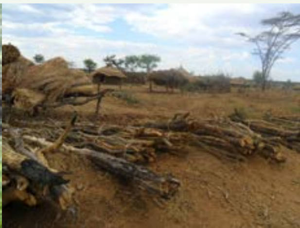
Figure 3: Fuel wood bundled for sale in Moroto district.

On the other hand, charcoal will remain the dominant energy source for the urban areas due to the unaffordability of the available alternatives such as solar, gas and electricity to the majority of the urban dwellers. The use of the traditional earth kiln for charcoal production, with a low recovery of 8-15%, results in the rapid and wasteful depletion of the natural feedstock and is not profitable for feedstock from the plantations raised at high cost. There are initiatives to introduce and promote improved charcoal kilns such as the Casamance (modified earth kiln) with efficiency of 20-30% and the Adam and Sam1Retort kilns and Half Orange 30-40% for small scale production and the Missouri and CK Euro kilns 35-42% for large scale production. The Missouri Kiln in New Forest Company produces about 3,850 tons of charcoal from