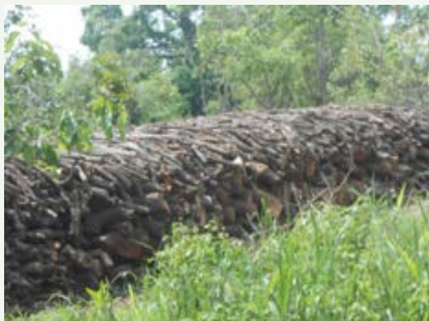
Figure 2: Preparing earth charcoal kiln - wasteful technology for charcoal production in Nwoya district.

Firewood will remain the dominant biomass energy source in the rural areas depending on supplies from the natural wood in patches of forests remaining, woodlots and trees on farmlands. The current annual fuel wood biomass demand of about 60 million m 3 requires an area of at least 2 million hectares of woodland (30m 3 /ha/yr.) or about 300,000 ha (200m 3 /ha/yr.) of well managed plantation (MEMD, 2013). The rate of harvesting the existing natural forests and plantations far exceeds the natural capacity of the forests to regenerate. Similarly, the area of new biomass energy plantations so far established is not commensurate with the demand. This has led to the unsustainable harvesting of biomass resources resulting in the overall deforestation and forest degradation experienced throughout the country (see Figures 2 &3) .